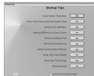
"Quick Start-Up" Menu

For over fourteen years, Numa has been the leader in nuclear medicine connectivity and system integration, with solutions that deliver enhanced throughput, efficiency and productive workflow. Numa meets specific needs in nuclear medicine, nuclear cardiology, PET and PET/CT for image management, archiving, multi-vendor connectivity, DICOM modality worklist management, and secure file transfer throughout the department, enterprise and beyond. Visit their website at: www.numa-inc.com ■