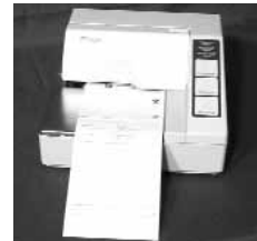
Epson Ticket Printer: Item #5430-0100