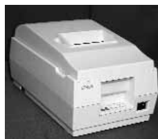
Epson Roll Printer: Item #5430-0058