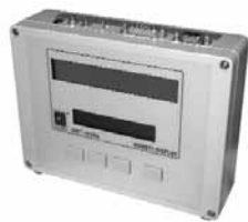
CRC-25 Remote Display: Item #5130-2224