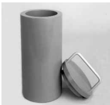
Auxiliary Shield: Item #5420-2116